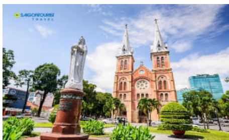
Notre Dame Cathedral